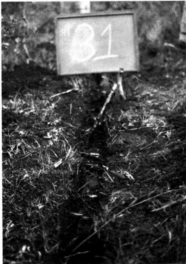
Figure 2. A root trench excavated away from a skid trail. Note the pieces of large, near-surface aspen roots exposed by this trench.

A 3 m trench was excavated to 0.2 m depth within each transect of density/moisture determinations, using a high-pressure water jet (Figures 1 and 2). The depth and diameter of each root larger than 4 mm intersecting a plane projected down the center line of the trench was recorded. Root density, diameter,