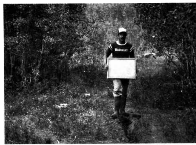
Figure 1. A nonstocked skid trail passing through a 12-yr-old aspen sucker population. The 3 m root trench is in the foreground. Note the lack of large near-surface aspen roots in this trench.

Logging impacted soil density, root survival, and the number of aspen suckers in skid trails compared to other areas in the aspen clearcuts. Dry soil density under skid trails averaged nearly 30% more than that of untracked areas. Skid trails contained less than a third of the roots found in untracked areas, with similar differences in root volume. Consequently, about ten times as many aspen suckers were found in untracked areas compared to skid trails (Table 1).